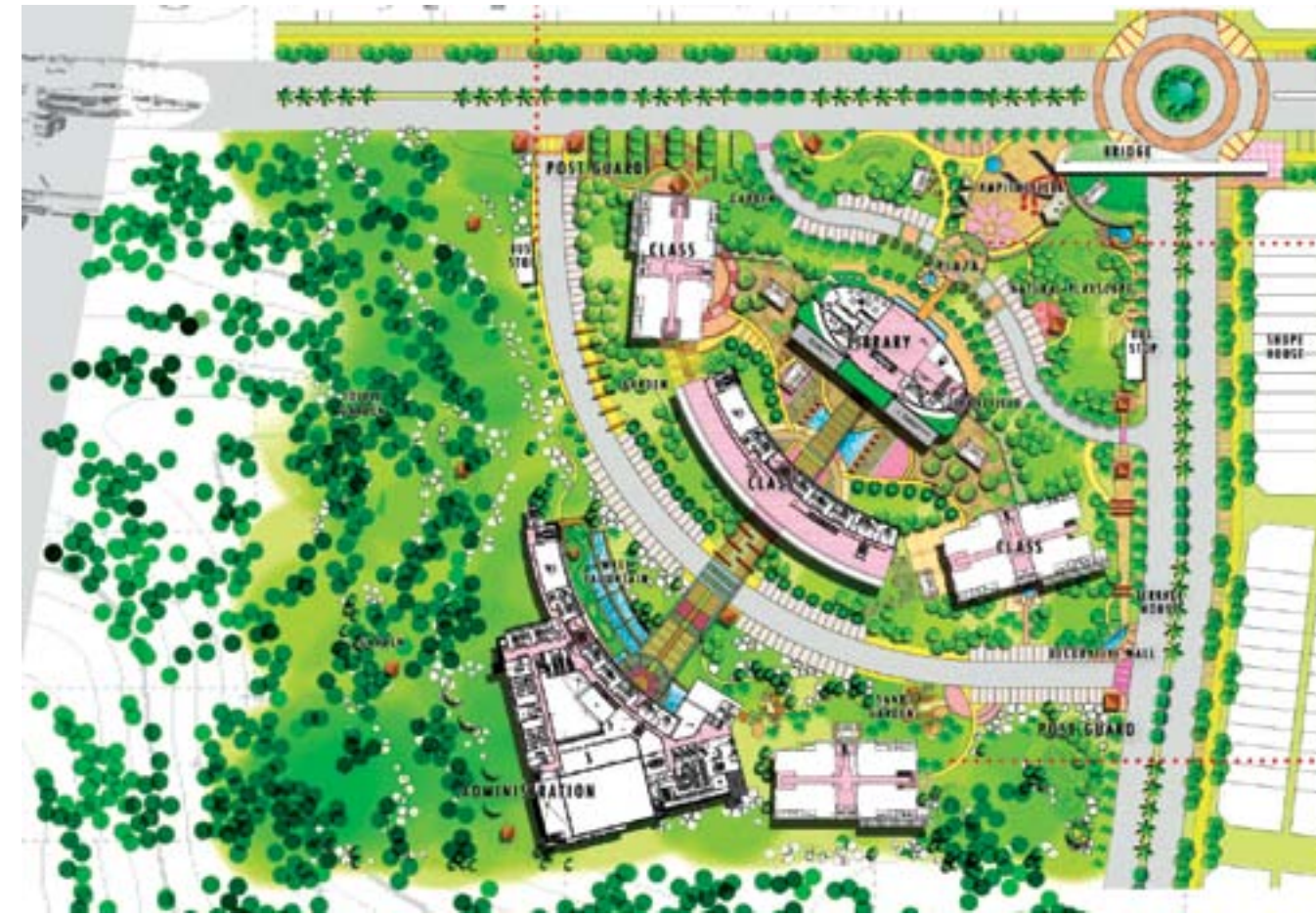
Rohaniah Mohd Nor

Buildings are organised to form a series of courtyards, gardens and water elements forming a sequence of spaces with a strong visual axis. The academic core is located in the inner layer while the residential units for staff form the innermost layer of the scheme. The meaning of integrated community college is reflected in the absence of hard edges of the site. Instead, physical and visual connectivities, integrated human interaction within the spaces and sense of harmony between interior and exterior spaces are made abundant.