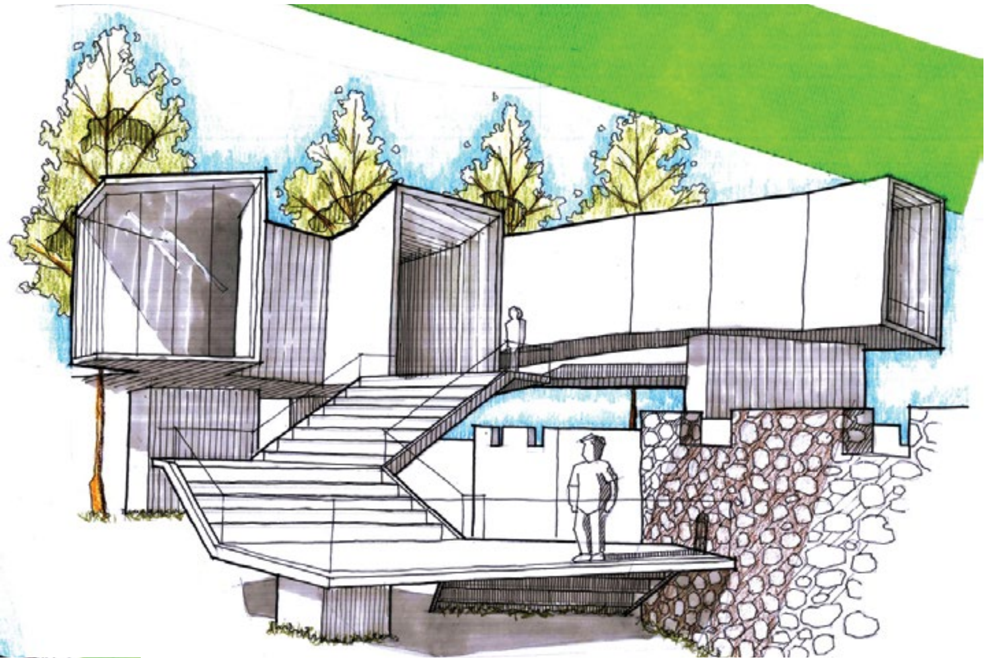
Clifford Loh Jia Yang

The proposed scheme acknowledges the strong presence of remnants from the old fort and created a contemporary structure that seems hovering above the old fort. The contrasting form and texture of the new structure enhance the beauty of this historical fort's stone masonry structure. The design responds well with the pristine nature of the context by utilising a low 'hugging-to-earth' form that respects the endearing longevity of the old fort and thus harmonises well with its surroundings.