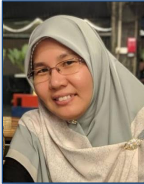
Senior Lecturer Department of Community Health Faculty of Medicine and Health Sciences Universiti Putra Malaysia