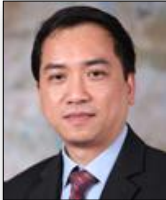
Dean Faculty of Medicine and Health Sciences Universiti Putra Malaysia